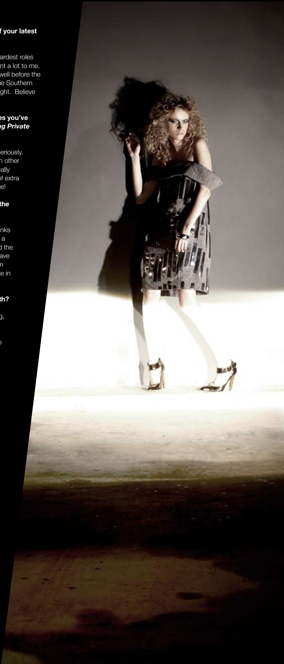
Grey wool dress with metal details by Chloé Black patent heels by Jimmy Choo Metallic bracelet stylist's own

Well, I suppose I never really talk about my teenage years in interviews. I had a really tough time growing up in the States – sent over when I was 12 and going to school in a New York suburb. All I'll say is there was a lot of bullying. I couldn't speak a word of English and I was the only Asian kid in the class.