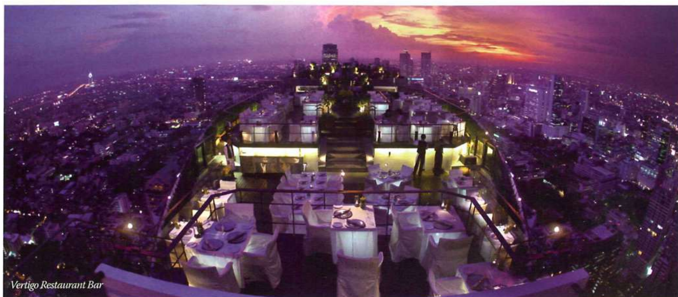
Vertigo Restaurant Bar