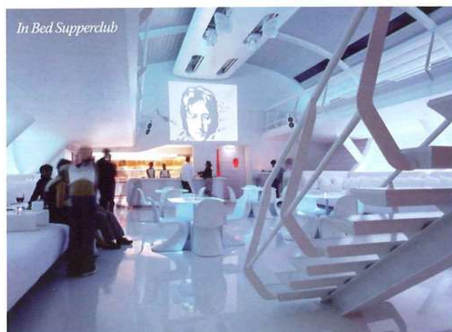
In Bed Supperclub

spreads at Sheraton Grande Sukhumvit and Four Seasons.