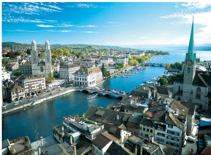
Above right: Bern cityscape; Lake Lugano, Left: Fraumunster Church in Zurich

THAI operates daily flights to Zurich. For more information, please visit www.thaiairways.com