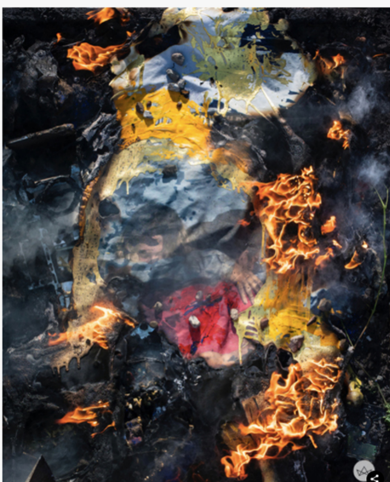
Korakrit's work blurs the line between reality, fiction and fantasy.

"Painting with History in a Room Filled with People with Funny Names 3" at Bangkok Citycity Gallery