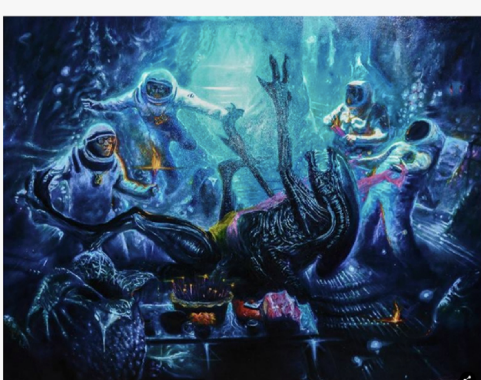
One of the satirical works currently on display at the gallery.

"Extremely Nonsense" at Kalwit Studio&Gallery