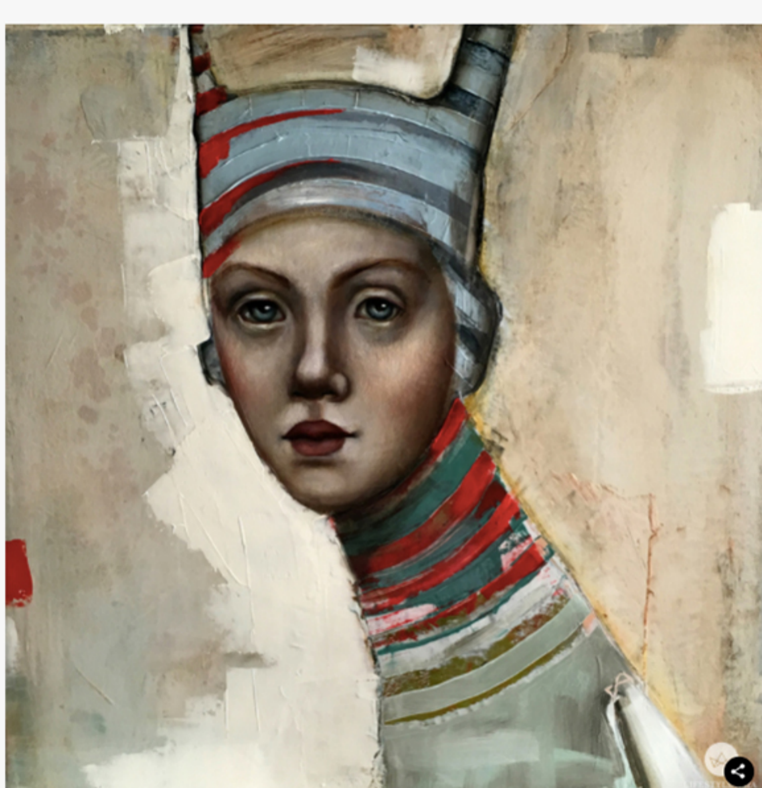
Portrait of the iconic Egyptian Queen Nefertiti.