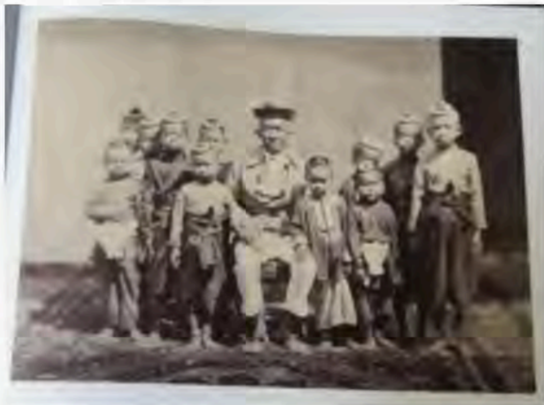
A photo of King Rama IV and his children, captured by Carl Bismark.

Many pictures of Siam are currently owned and kept by foreigners abroad and have never been shown in Thailand — until now. This exhibition offers a fascinating glimpse at Siamese ways of life of more than a century ago. A total of 150 rare photographs, developed from foreign collectors and institutes' original photo prints and collodion, record the development of Siam and are on view at the Bangkok Art and Culture Centre.