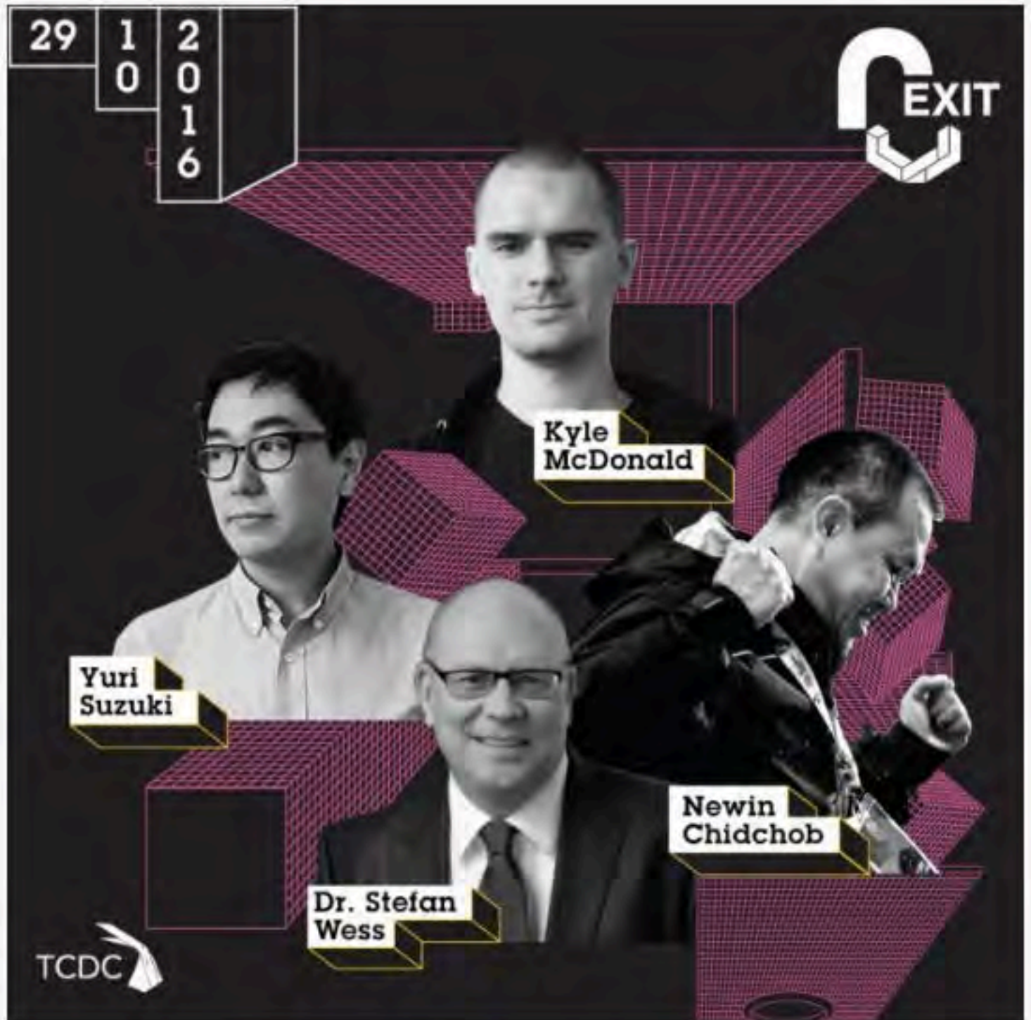
International speakers will be flying into Bangkok for Creativities Unfold.